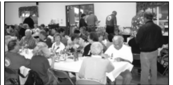
Everyone had their fill and the desserts were great.