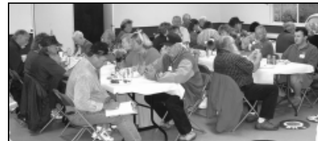
Lots of good food and conversation.