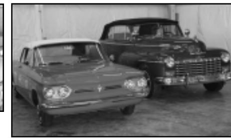
'60's Corvair and Arlene's 1946 Dodge Convertible