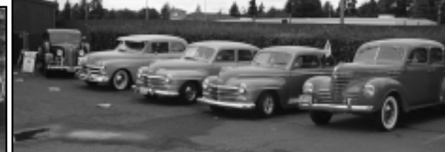
Lots of Plymouths fill the parking lot at the Hot Dog Feed