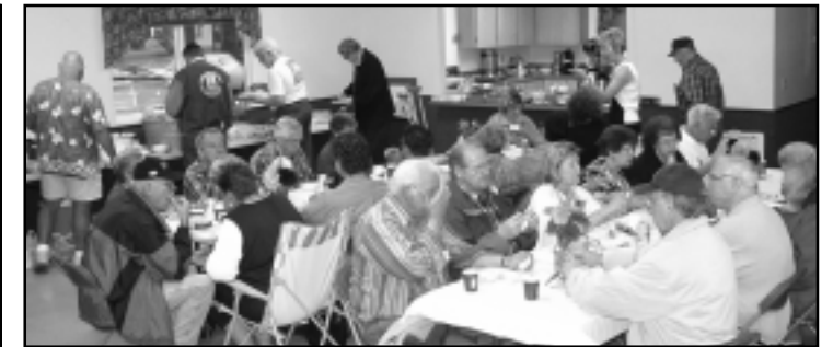
Lots of stories to share throughout.