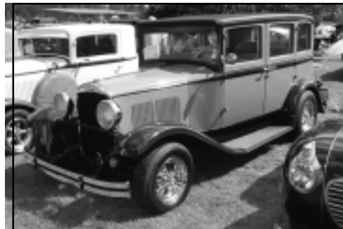
Unidentified 1929 Plymouth 4-door Sedan