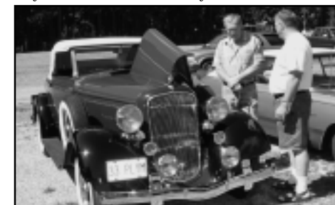
Tom and Kris Nachand's 1933 PD Convertible Coupe

If you have to be stranded along the side of the road in the middle of nowhere there couldn't be a nicer bunch of people to be stranded with.