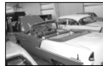
1955 Chevy Convertible