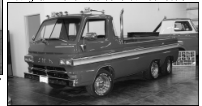
This 1968 Dodge Custom Pickup with rear steering

everyone took in the spectacular view from their home on the point at Lake Tapps.