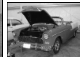
1955 Chevy Convertible