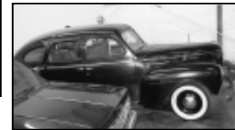
Newest Plymouth 1941 or '42??