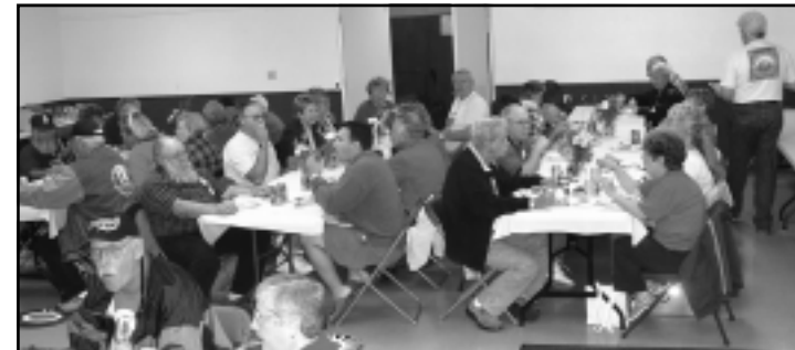
There was a good mix of regular and new members