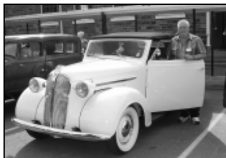
Sumner Host Gary Peterson with he and Arlene's 1937 Convertible with Rumble Seat

So, the newest car in the bunch and the lead car at that was pushed through the four way stop over to a gravel corner surrounded by cows in the field and a couple of silos, one with a tree growing up out of the middle of it.