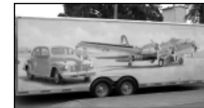
Bill's Call's custom painted car trailer you need to see up close to really appreciate.

If you've already recycled your paper you can read the article by going to www.oregonlive.com and entering "Bill Call" in the search section. Scroll down to September 2nd and look for "A Passion for Plymouths".