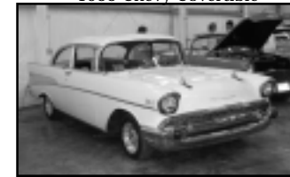
1957 Chevy Hardtop