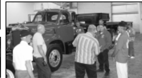
Gary Peterson's B Modle 1950 MAC Truck