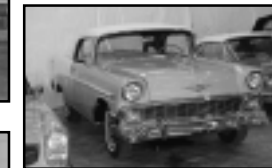
1956 Chevy Convertible