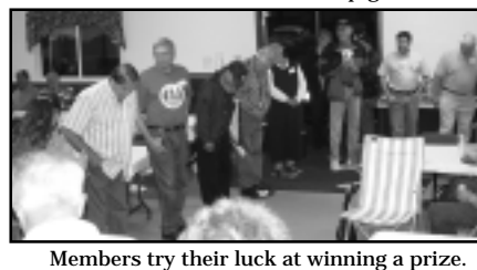
Members try their luck at winning a prize.