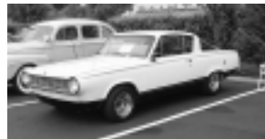
1966 Barracuda w/63-65 Dodge Dart front end.

Meetings are held on the 4th Tuesday of each month at the Clackamas Community Club 15711 SE 90th - Clackamas, OR 6:30 PM Kick the Tires, 7:00 PM General Meeting.