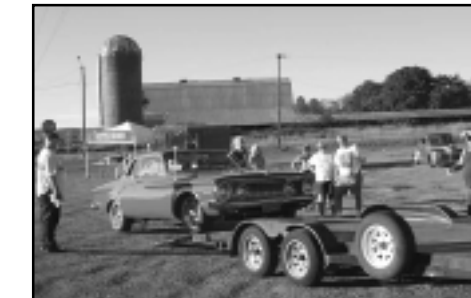
Mystery 1962 Plymouth Sport Fury 2 Dr. Hardtop